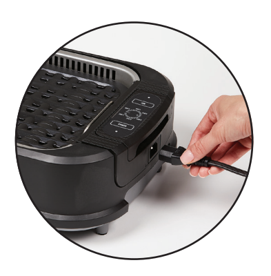
Attach the Power Cord to the Base Unit and then plug the Power Cord into an outlet. The Control Panel lights up when plugged in.