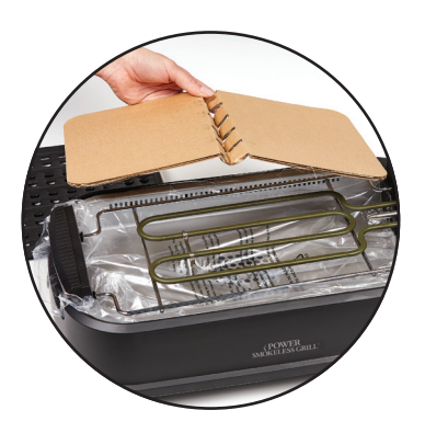
Disassemble the packed parts and remove all packaging materials.