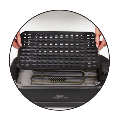
Reassemble the parts in the same order they were packaged (see reverse side for detailed instructions).