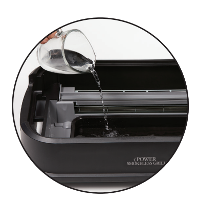
Ensure that the Water Tray is in place and fill with about 2 cups of water.