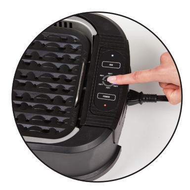
Press the Power Button to operate the grill and then press the Fan Button. Set the temperature to a medium or high heat setting for 4-6 mins. to preheat the grill. Then, set the desired cooking temperature and add your food!