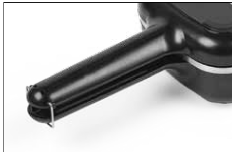
Fig. ii: Appliance is locked when latch is closed