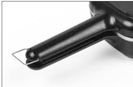
Fig. i : Open latch