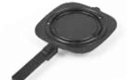
PRESSER PLATE (FLAT SIDE)