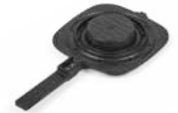
PRESSER PLATE (PRESSING SIDE)