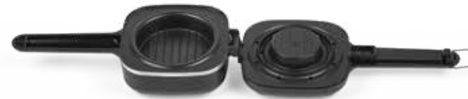
CONFIGURATION A Use to press pocket into food