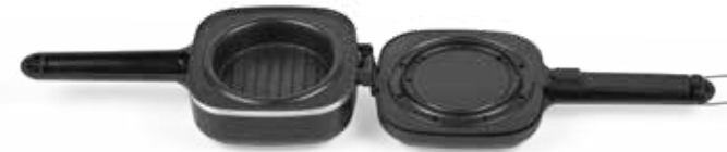
CONFIGURATION B Use to seal and flatten after filling