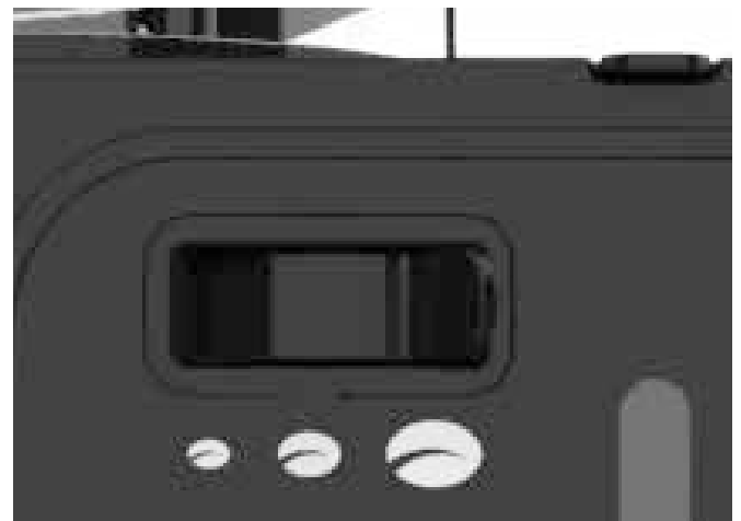
Fig. B. The Grind Adjustment Lever. The larger setting gives you more coarsely ground coffee, while the smaller setting gives you more finely ground coffee.